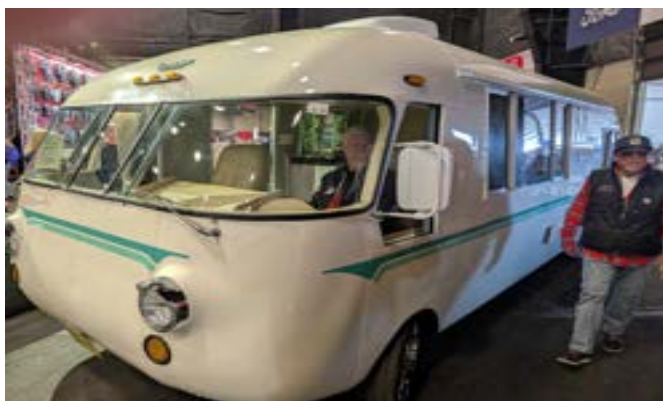
This 1968 Ultra Van with Corvair engine went for 20k. If I only had a bidder's badge...

Being on the block has its advantages, though, especially early in the week when the less expensive cars are sold. That's usually when the Corvairs and other orphans go through. It's my favorite part of the week and it's when I'm the most distracted. So far I haven't gotten anybody killed. :)