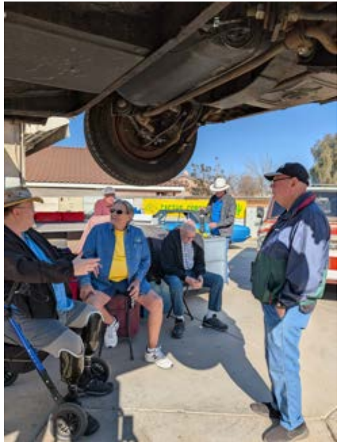
The gang solving all the world's problems--some of them automotive!