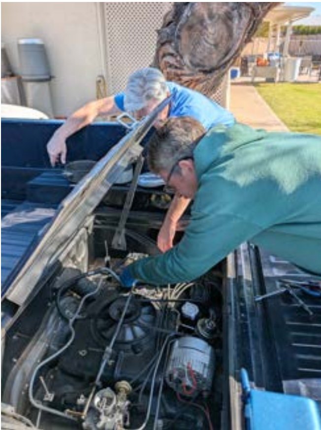
Tuning the carbs.

We took a break from doing automotive stuff to talking about automotive stuff over pizza. We got back to work for a while and then finished the day off with an impromptu Corvair parade through downtown Gilbert and a trip to Handel's Homemade Ice Cream. All in all it was a pretty successful day and we hope to do more live tech sessions in the future.