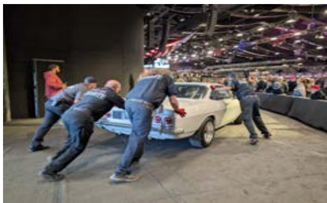
Sometimes even the most beautiful cars need a little help. That's me on the corner.

Note the driver trying not to hit the oblivious guest.