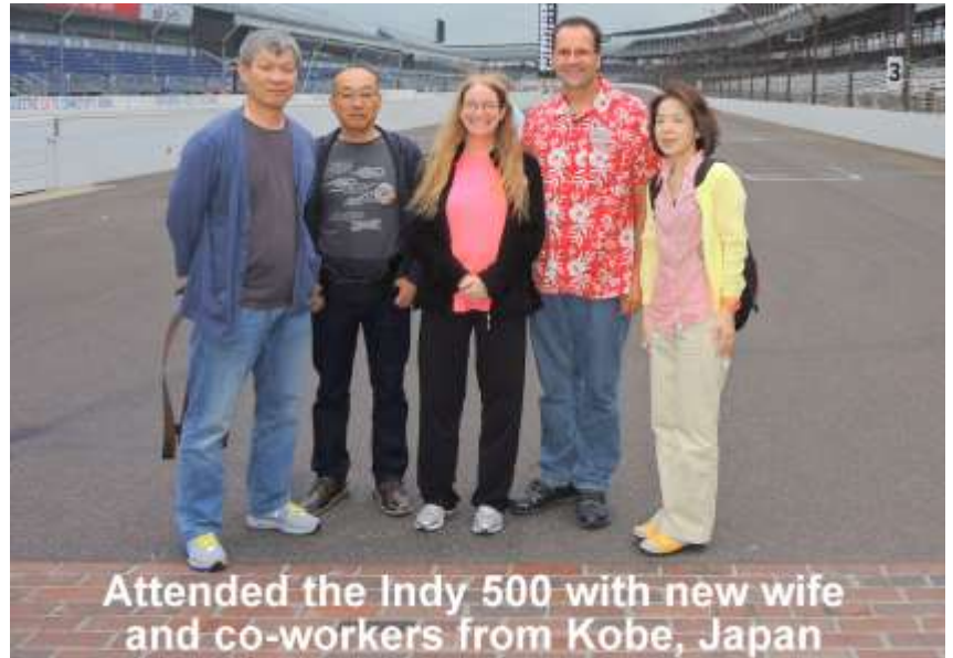
Attended the Indy 500 with new wife and co-workers from Kobe, Japan