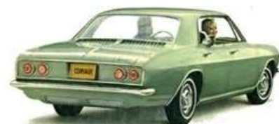
Preserving Chevy's Rear Engine Fun Car

February 7 Regular Club Meeting - Earnhardt Chevrolet – 7PM March 7 Regular Club Meeting - Earnhardt Chevrolet – 7PM April 4 Regular Club Meeting - Earnhardt Chevrolet – 7PM May 2 Regular Club Meeting - Earnhardt Chevrolet – 7PM June-August No Regular Club Meetings -