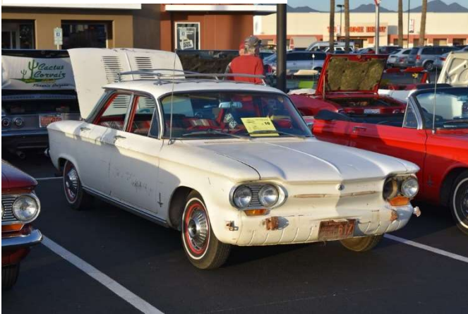
First Place - Early Model