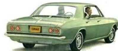
Preserving Chevy's Rear Engine Fun Car

January 2 Regular Club Meeting - Earnhardt Chevrolet – 7PM January 26 Agri-Country Bluegrass Festival & Car Show – Pinal County Fairgrounds February 2 Regular Club Meeting - Earnhardt Chevrolet – 7PM February 16 2 nd Annual St. Thomas More Car Show - Glendale March 6 Regular Club Meeting - Earnhardt Chevrolet – 7PM March 9 Caliente Clowns Car Show - Florence