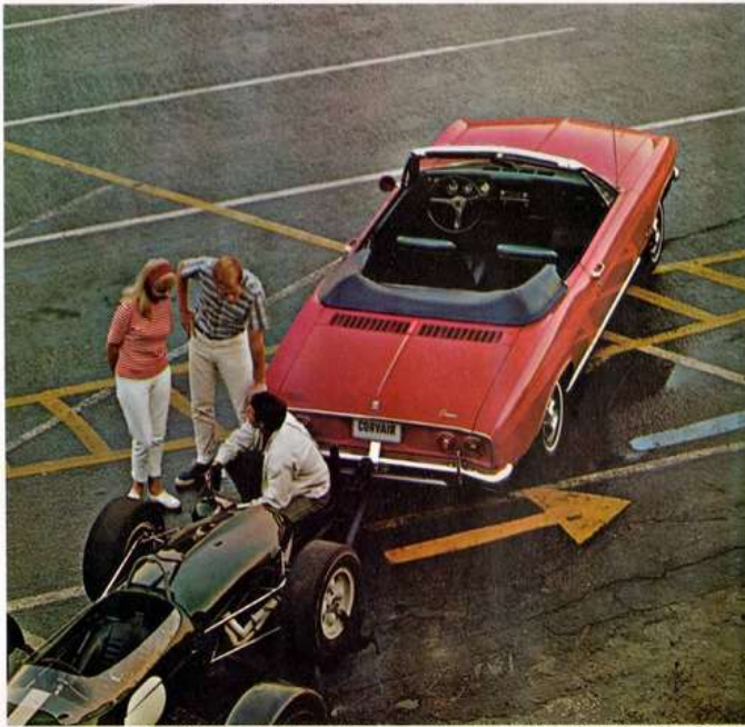
Shown on front cover: Monza Sport Coupe. Shown above: Monza Convertible.

For nearly a decade Chevrolet has built rear-engine fun cars. In that time, Corvair has established itself as a firm favorite with U.S. enthusiasts. Reasons: rear-engine design with great roadability. Independent suspension at all four wheels (like the famous Corvette) for supple ride. With the engine weight in the rear, over the driving wheels, traction is superb. (Just ask owners who live in winter climates!) But with all these virtues, why the low price? Chevrolet know-how, that's why.