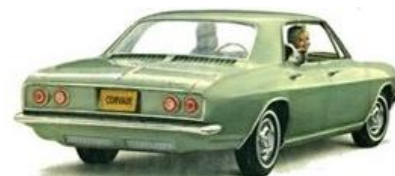
Preserving Chevy's Rear Engine Fun Car