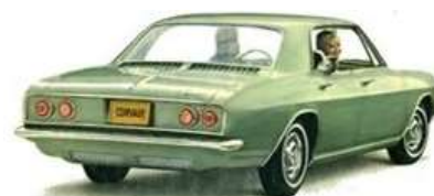
Preserving Chevy's Rear Engine Fun Car