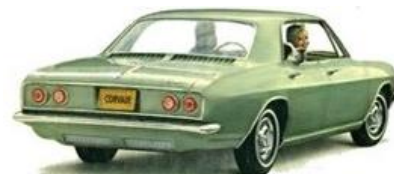
Preserving Chevy's Rear Engine Fun Car

December 6 NO Regular Club Meeting! December 9 Christmas Party – La Famiglia Italian Pizza & Pasta 11AM- 2PM SE Corner Dobson and Guadalupe January 3 Regular Club Meeting - Earnhardt Chevrolet