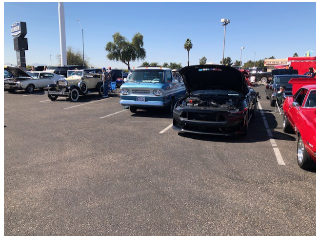
A wide variety