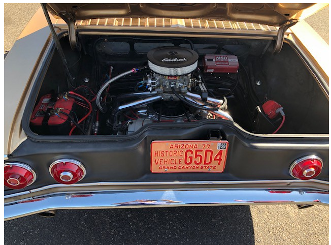
It's a clean machine (apologies to Lennon & McCartney)