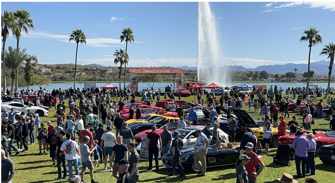
You could be a part of this!

It's April. That means that the rescheduled Concours in the Hills will be coming up shortly. The event will take place on April 19 th . Registration is now closed again but you can still attend as a guest. The Club will be meeting at the Wendy's parking lot on Shea Boulevard at 7AM the morning of the show so that we can ride in and park together. Details are on the Club Calendar .